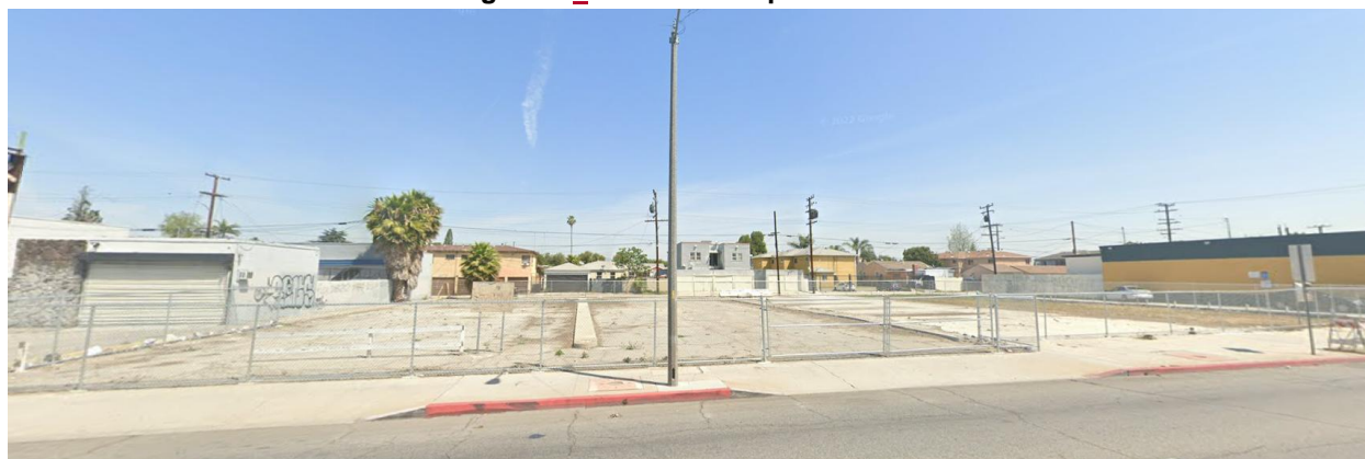
Figure 4-3: Site on Compton Boulevard

Site on Compton Boulevard includes 10 parcels and is fenced in as one property.